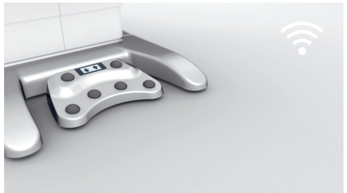
6. Controlled by wireless technology