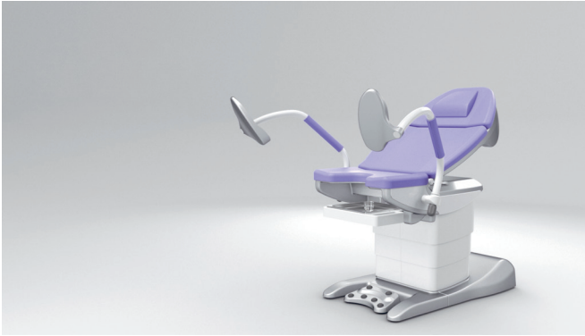
11. Memory function – a variety of individual examination positions can be saved