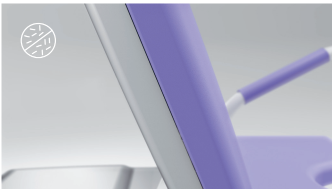
7. Antimicrobial powder coated finish and padding