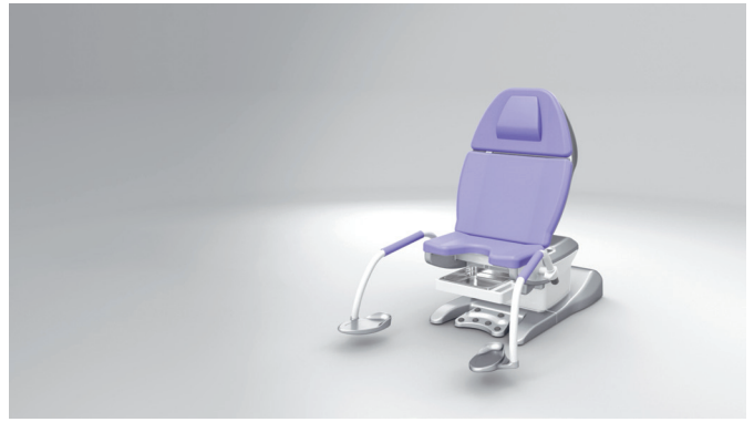
2. Comfortable initial position setting new standards