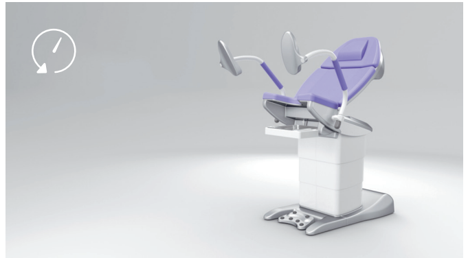
4. Time-saving thanks to cutting-edge drive technology