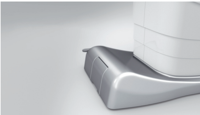
15. Maximum durability thanks to workmanship featuring state-of-the-art ABS plastic materials