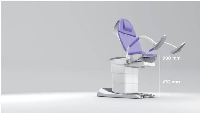
1. Unique height adjustment range