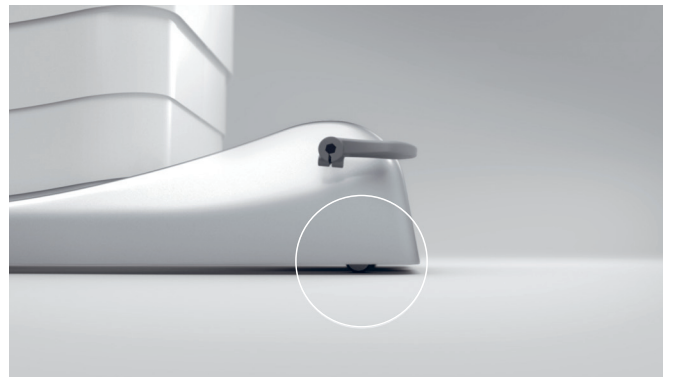
16. Flexibility through mobility