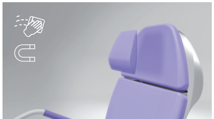
8. Head cushion held in place by simple hygienic magnet