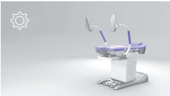
5. Simultaneously coordinated movement sequences