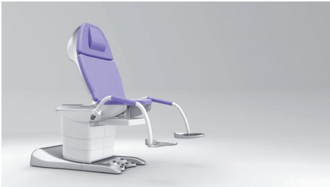
3. Extremely comfortable upright sitting position