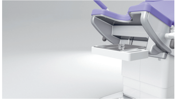
12. Rinsing basin remains horizontal automatically