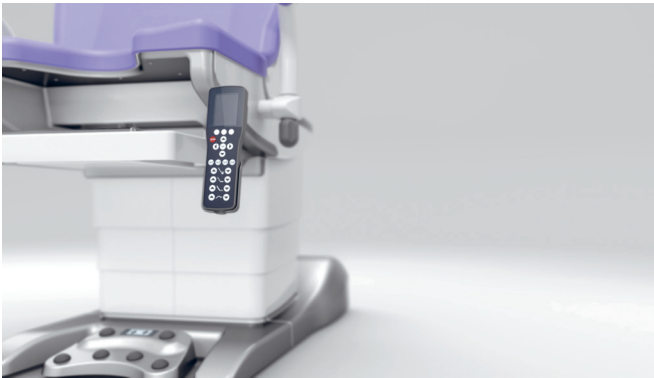
13. Hand control with screen and swivelling holder