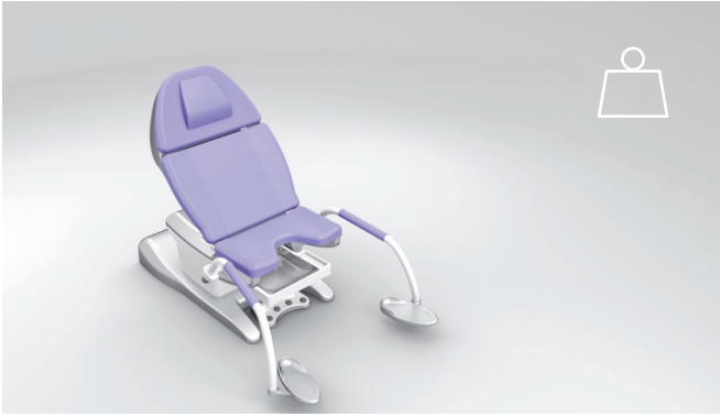
9. Strong safe working load of 300 kg